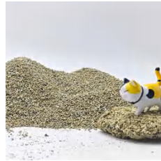
Broken Mineral Cat Litter