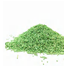
Strip Tofu Cat Litter

Tofu Cat Litter is always our flagship product. Made of food-grade soy pulp, it is a safe and natural option for your beloved cat.