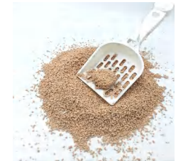
Crushed Tofu Cat Litter