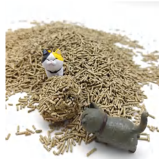
Corn Cat Litter

Corn Cat Litter , 100% natural and safe, is totally made from the non-edible part of the corn cob. Comparing with the other types of tofu cat litter of the same price, made of pea or soybean residue, it has better performance at odor control and clumping. It is also an excellent eco-friendly choice, with the litter is biodegradable and compostable and can be flushed down the toilet. In recent years, it has become increasingly popular all over the world.