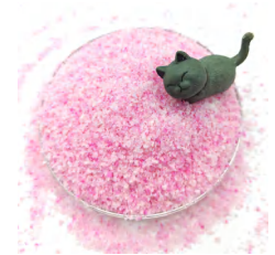
Clumping Crystal Cat Litter