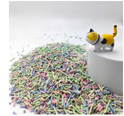
3:7 Mixed Cat Litter