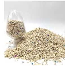
2:8 Mixed Cat Litter

Mixed Cat Litter is made from a mixture of bentonite cat litter and tofu cat litter. It is cost-effective and combines the advantages of mineral cat litter and tofu cat litter.