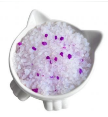
Non-clumping Crystal Cat Litter

Crystal Cat Litter also called Silica Gel Cat Little, is an ideal pet garbage cleaner, which has unparalleled excellent characteristics of other cat litter. There are 2 types of crystal cat litter: clumping and non-clumping Crystal cat litter.