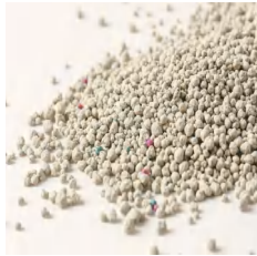
Ball Shaped Mineral Cat Litter

Lucky Spirit mineral cat litter is made from 100% natural sodium-based bentonite as raw material, while using advanced processing technology (triple dust removal process and triple deodorization process). So comparing with the same type of products in the market, obviously it has better performance.